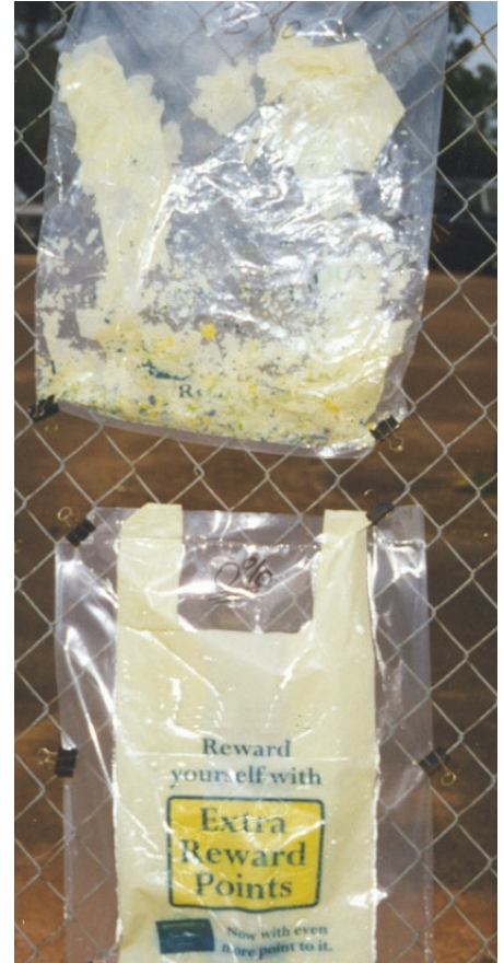
Illustration of photo and thermal degradation of a carrier bag incorporating EPI's TDPA® additive (top row) vs. a bag without EPI's TDPA® additive (bottom row). Test procedures follow ASTM D5272 "Outdoor Exposure Testing of Photo Degradable Plastics" Guidelines.

This product is made possible by EPI's pioneering OXO-BIODEGRADABLE additive technology that has been recognized under the ASTM 6954-04 guide. Exposure to sunlight or heat triggers a two-step process, wherein the plastic breaks down through oxidation into small fragments, which then decompose into the natural elements of carbon dioxide, water, biomass, and minerals.